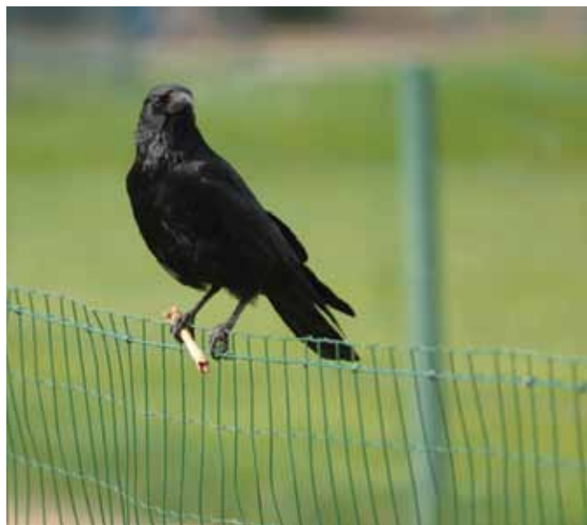
Crows can use tools, solve problems and recognize faces.

One kind of thinking that animals do is problem solving. Problem-solving skills are very important because animals may need those same skills in the wild to find food and shelter and to avoid their predators. One problem that ravens and crows have solved very well is how to live close to humans without getting in their way. The next time you're outside, look around. You may find a flock of ravens or a murder of crows waiting nearby.