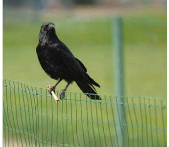
Crows can use tools, solve problems and recognize faces.

One kind of thinking that animals do is problem solving. Problem-solving skills are very important because animals may need those same skills in the wild to find food and shelter and to avoid their predators. One problem that ravens and crows have solved very well is how to live close to humans without getting in their way. The next time you're outside, look around. You may find a flock of ravens or a murder of crows waiting nearby.